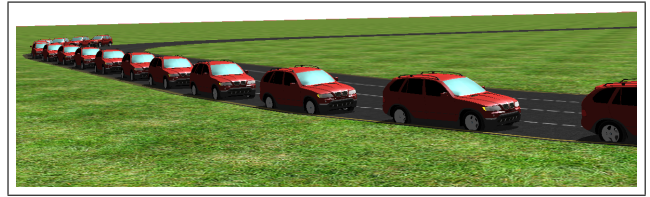
Fig. 1. A single-lane convoy of automated vehicles in Webots

The distributed graph-based algorithm is based on Laplacian control [16]. Each vehicle maintains a graph whose vertices represent vehicles and whose edges consist of the communication links [6], solely using the broadcast relative position of its neighbors. Using this graph and the Laplacian